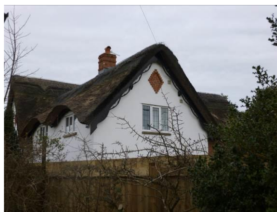
Replacement uPVC windows at 1 Wigsey Lane