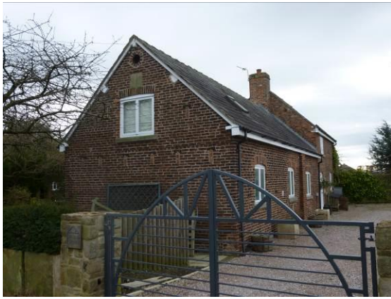
Sensitively-designed modern gates at Wigsey Cruck