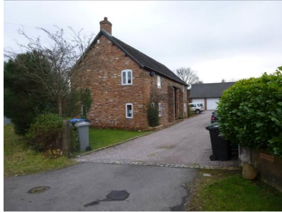
The Barn, Wigsey Farm. Note the very simple detailing and the wide opening between the two buttresses (slightly obscured by the restricted angle of the photograph taken from the public highway)