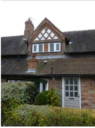
A large first floor dormer window with small lights