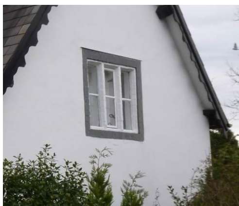
Historic casement windows