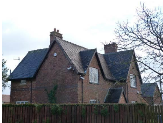
Townfield House, with a decorative diamond pattern in the roof tiles