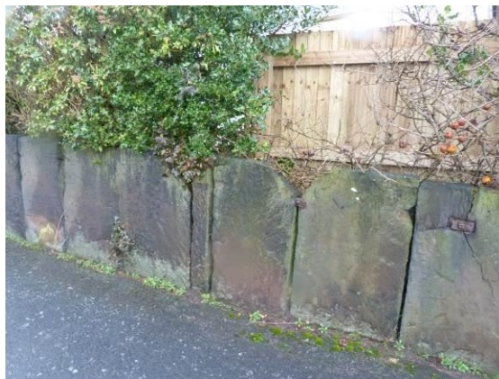
Characteristic flagstone wall with supplementary planting. Extra planting is preferable over the timber panelled fence. Also note the damage to the flagstones where the ties have been inserted.