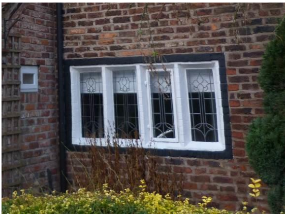
Brick mullion window

2.2.3 In the eastern portion of the Conservation Area, the buildings are notably more agricultural in character, a character which has been retained despite the large number of residential conversions. The historic farmhouses, as with the cottages, retain small window openings and a small amount of Arts & Crafts-influenced ornamentation. There is some degree of classical rhythm and proportion to the elevations. The converted agricultural buildings are notable for lacking in ornamentation and retaining their agricultural character through the incorporation of such features as the traditionally large door openings and haylofts as part of design for conversion.