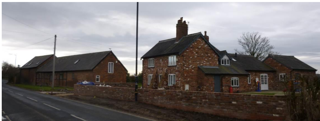
A converted farm building neighbouring an 18th-century farmhouse. Note the window created where the original hayloft access was located.

2.2.3 In the eastern portion of the Conservation Area, the buildings are notably more agricultural in character, a character which has been retained despite the large number of residential conversions. The historic farmhouses, as with the cottages, retain small window openings and a small amount of Arts & Crafts-influenced ornamentation. There is some degree of classical rhythm and proportion to the elevations. The converted agricultural buildings are notable for lacking in ornamentation and retaining their agricultural character through the incorporation of such features as the traditionally large door openings and haylofts as part of design for conversion.