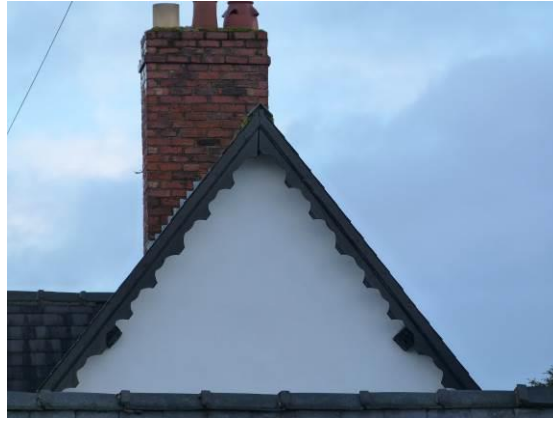
Decorative barge boarding on a Church Green cottage