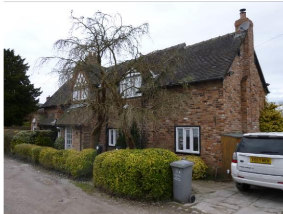
Well-maintained border planting on Church Green