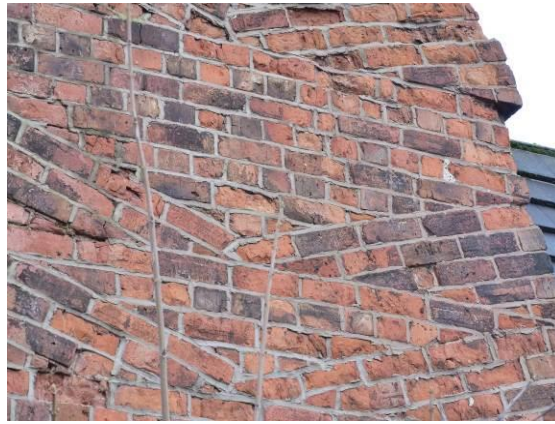
Damaged brickwork on the toll cottage due to inappropriate mortar repairs

ensure the longevity of the bricks, a traditional lime mortar should be used for the pointing rather than a cementitious mix, which can cause spalling and other damage. This is evident on the chimney stack of the toll cottage.