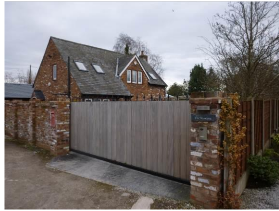
Inappropriate gates at The Rowans, Church Green